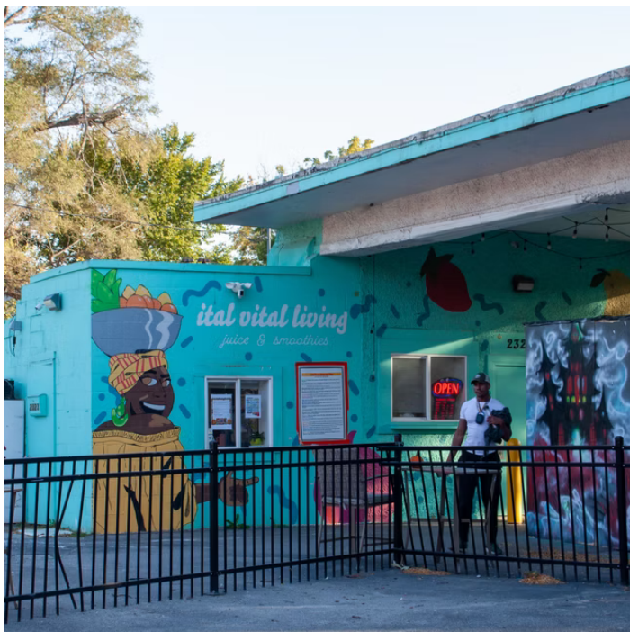
A black-owned smoothie shop on 24th & Grant.