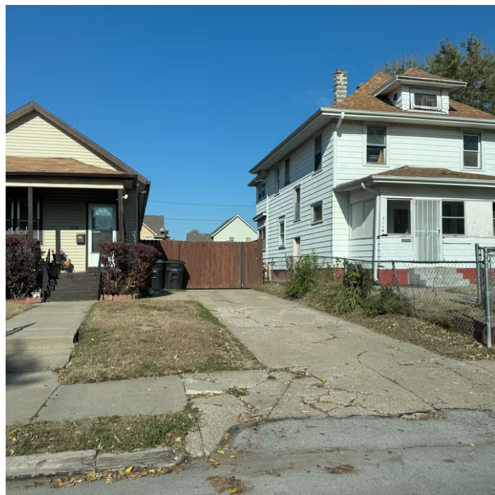
2 houses in the "D" area of the North Omaha redlining map.